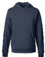
Hoodie Pullover Sweatshirt