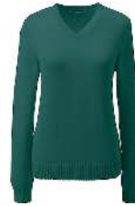
Drifter V-neck Pullover