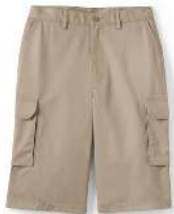
Stain Resistant Cargo