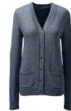
Drifter Button Front Cardigan