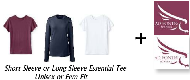
Short Sleeve or Long Sleeve Essential Tee Unisex or Fem Fit