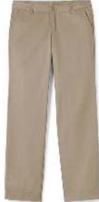
Khaki Plain Front Blend Chino