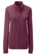
Zip-front Drifter Cardigan