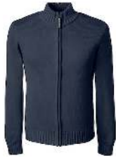
Drifter Zip-front Cardigan