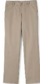
Khaki Plain Front Stretch Chino