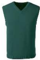
Drifter V-neck Vest