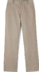
Khaki Elastic Waist Blend Chino