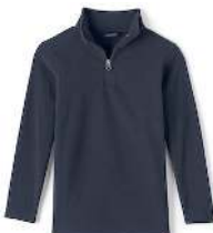
Lightweight Fleece Half Zip Pullover