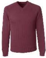
Drifter V-neck Pullover