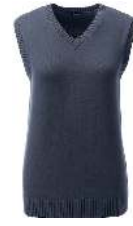
Drifter V-neck Vest