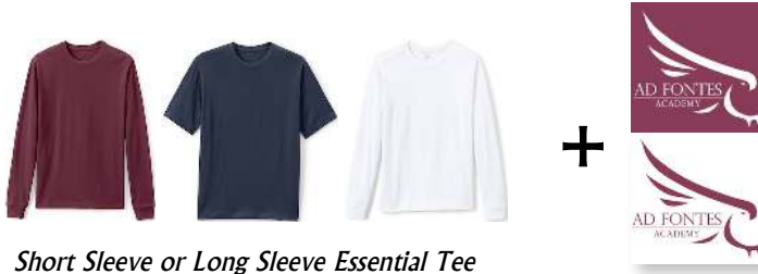
Short Sleeve or Long Sleeve Essential Tee