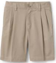
Blend Pleat Front