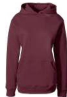
Hoodie Pullover Sweatshirt