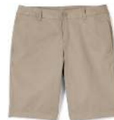
Plain Front Blend Chino Shorts