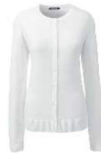
Fine Gauge Cardigan