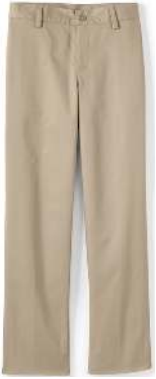
Iron Knee Blend Plain Front