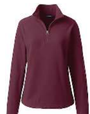
Lightweight Fleece Half Zip Pullover