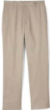
Tailored Fit (Blend or Cotton) Plain Front